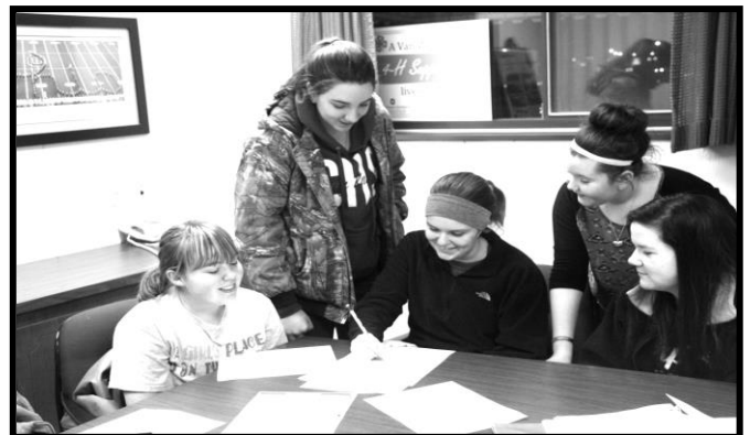
officers planning upcoming rabbit club meetings